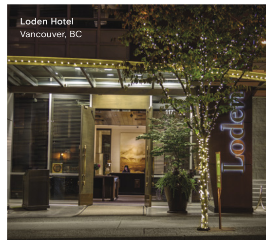
Loden Hotel Vancouver, BC