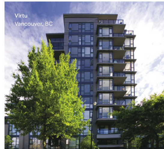
Virtu Vancouver, BC