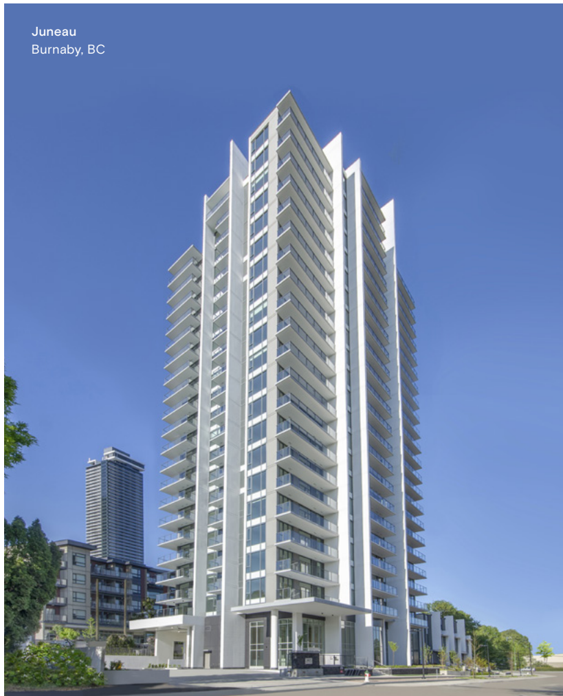
Juneau Burnaby, BC