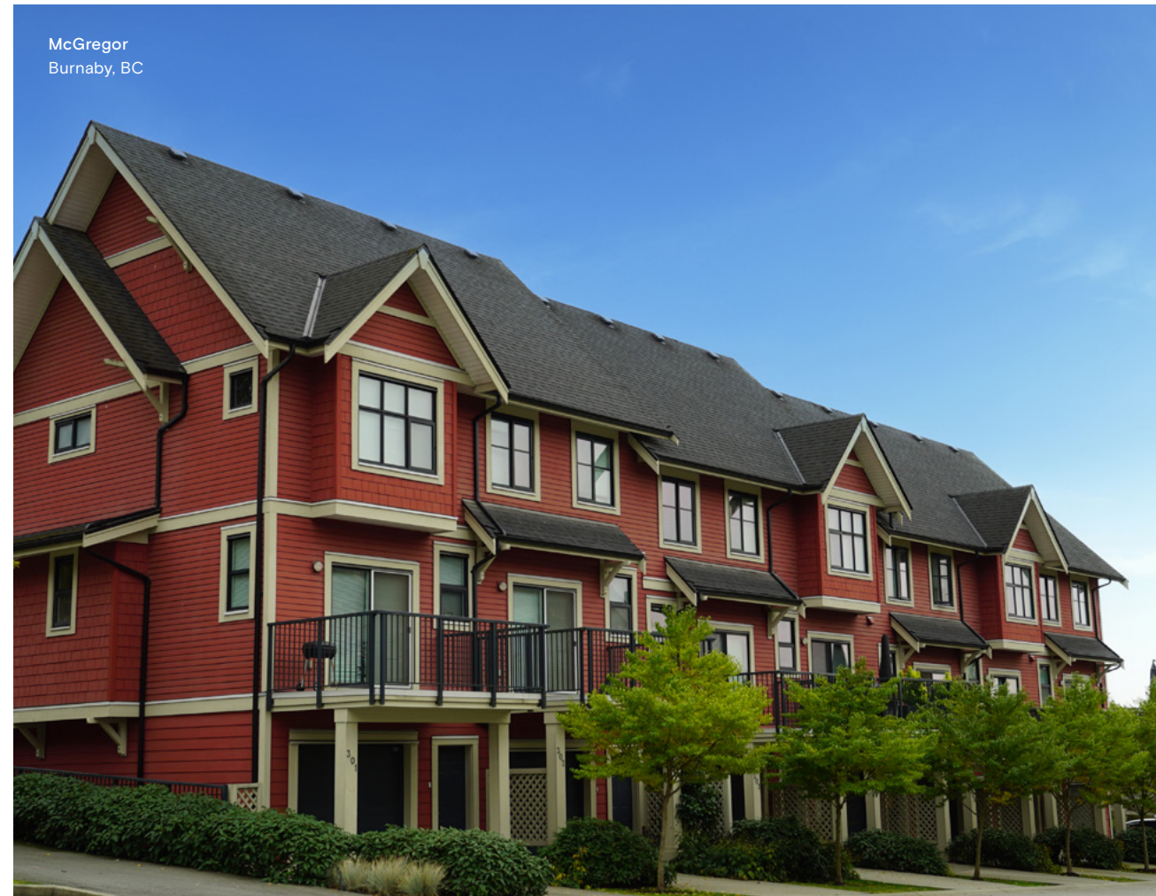
McGregor Burnaby, BC

For over 50 years, our business has been refining its vision for innovative living. As a result, Amacon is a leader in development, construction, and management of profoundly livable communities. Today our residential portfolio gives homeowners opportunities to live well from coast to coast.