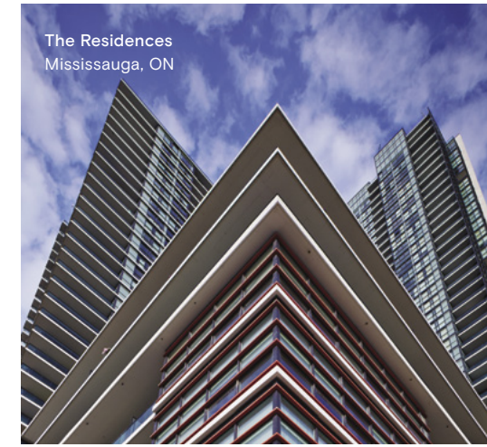
The Residences Mississauga, ON