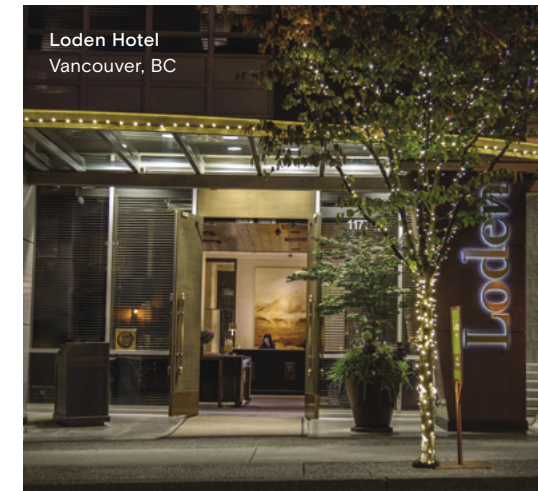
Loden Hotel Vancouver, BC

For over 50 years, our business has been refining its vision for innovative living. As a result, Amacon is a leader in development, construction, and management of profoundly livable communities. Today our residential portfolio gives homeowners opportunities to live well from coast to coast.