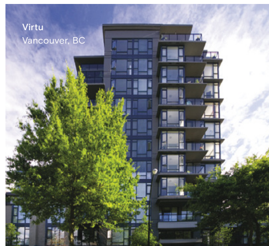
Virtu Vancouver, BC