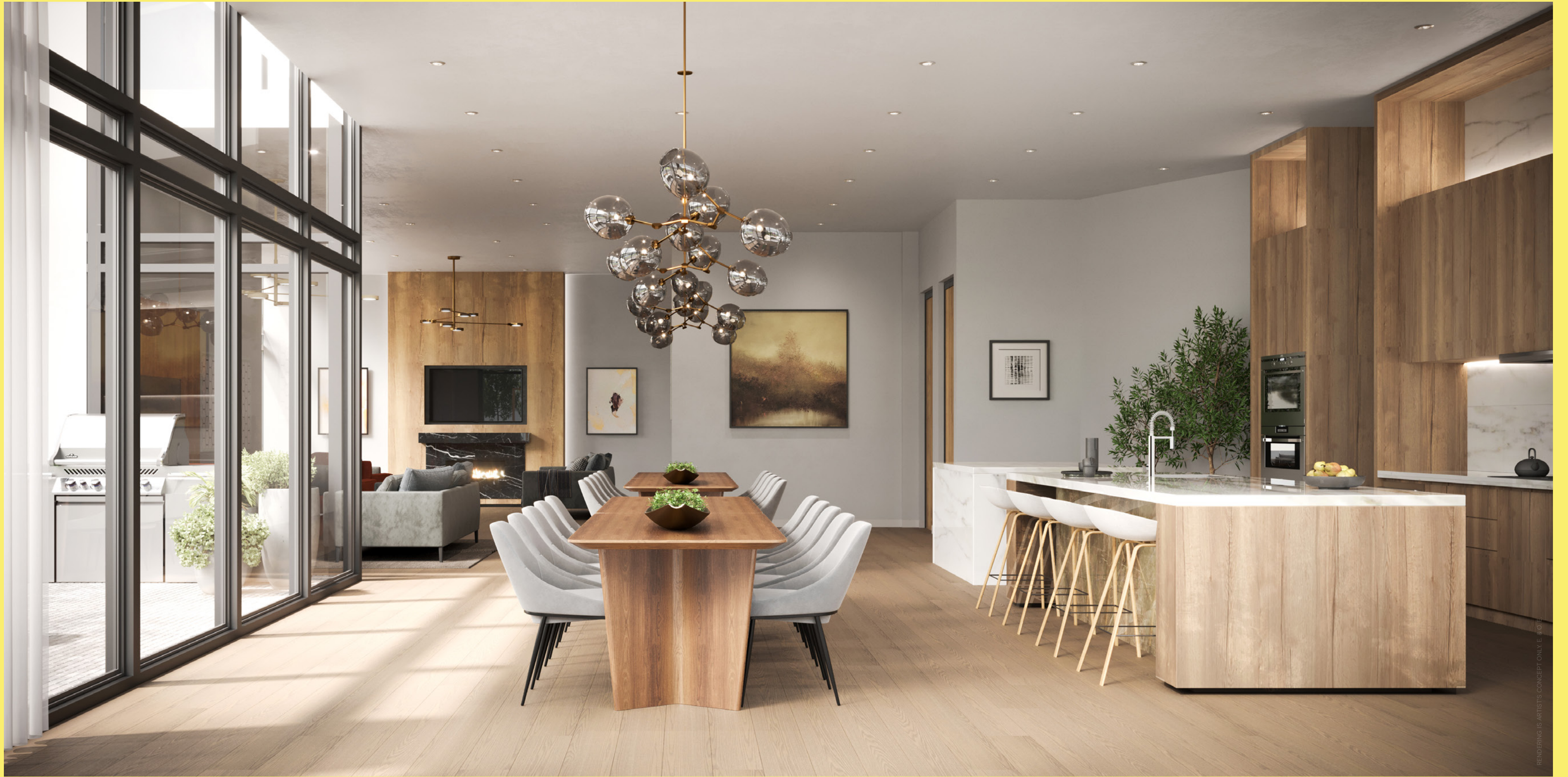
Party Room and Show Kitchen