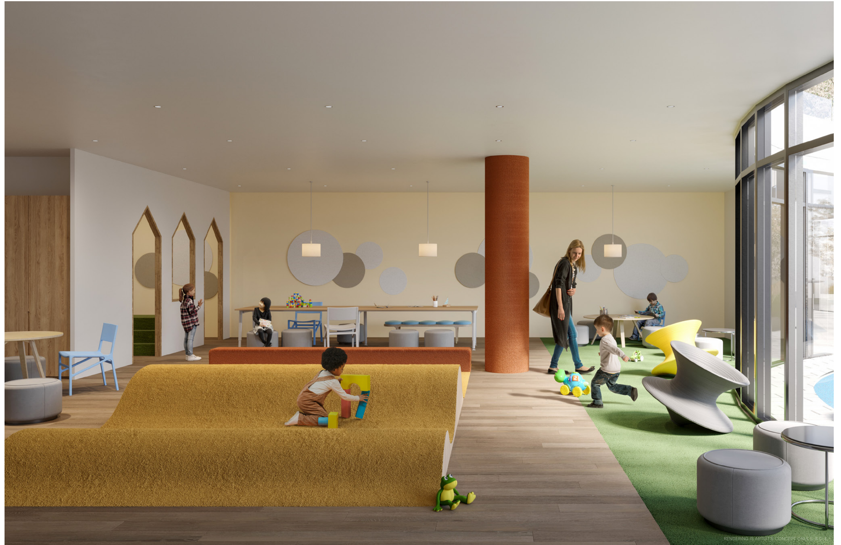
Indoor Kids' Zone

In the indoor kids' zone, kids can be kids. Plush floor cushions and bean bags in brightly lit areas are perfect for reading their favourite book. An indoor tree house encourages imaginative play during playdates with friends. The attached outdoor play zone has enough room for a spirited game of hide and seek.