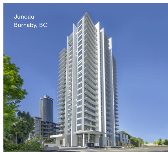
Juneau Burnaby, BC