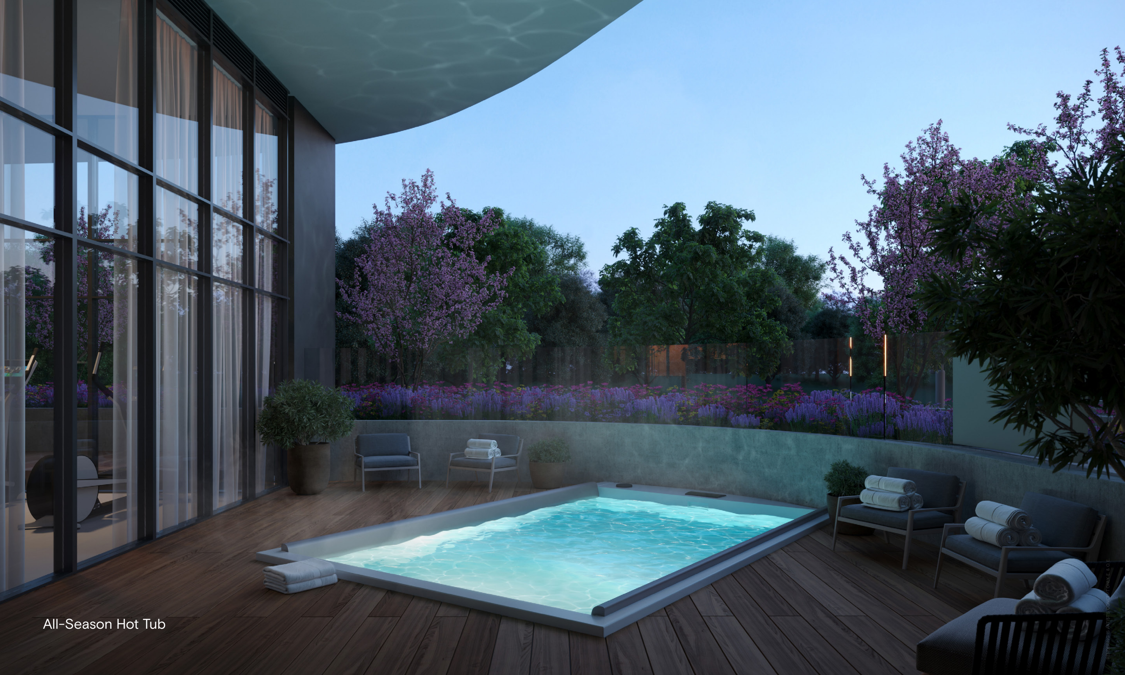
All-Season Hot Tub