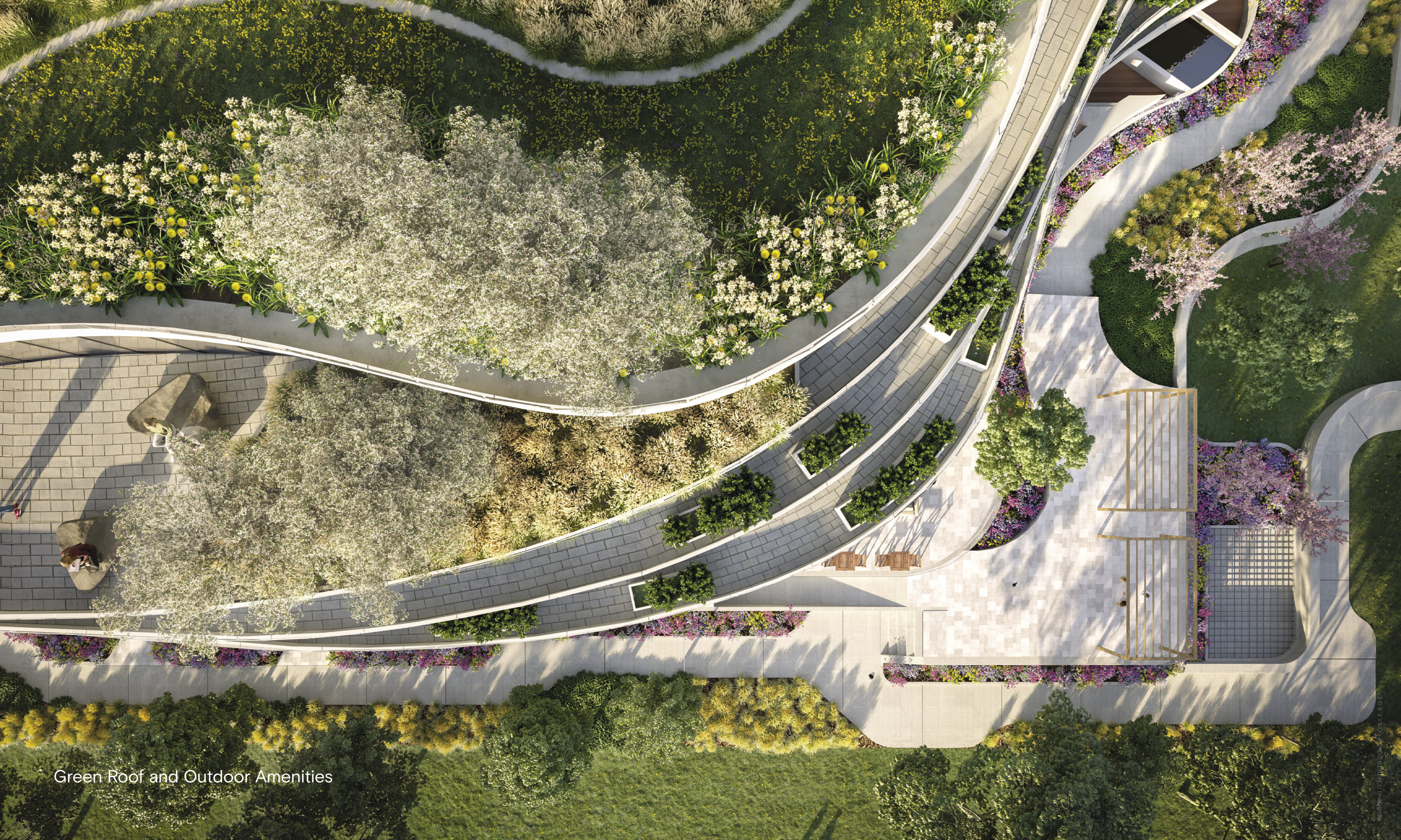
Green Roof and Outdoor Amenities