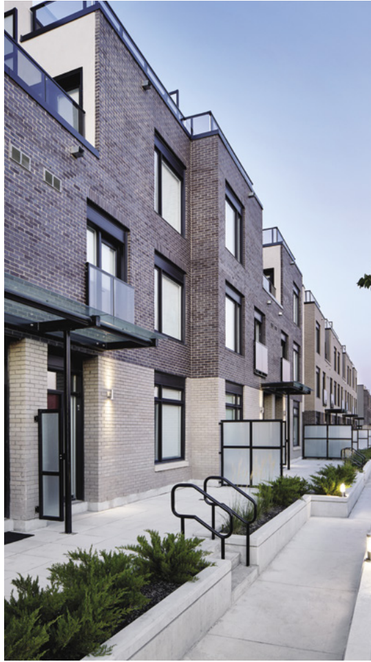
The Towns at Parkside Village