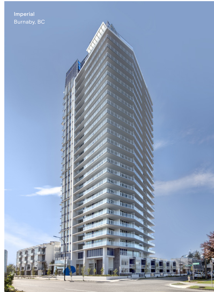
Imperial Burnaby, BC