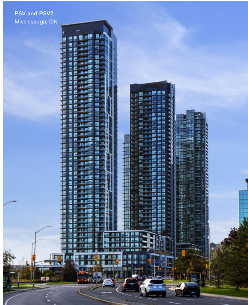
PSV and PSV2 Mississauga, ON