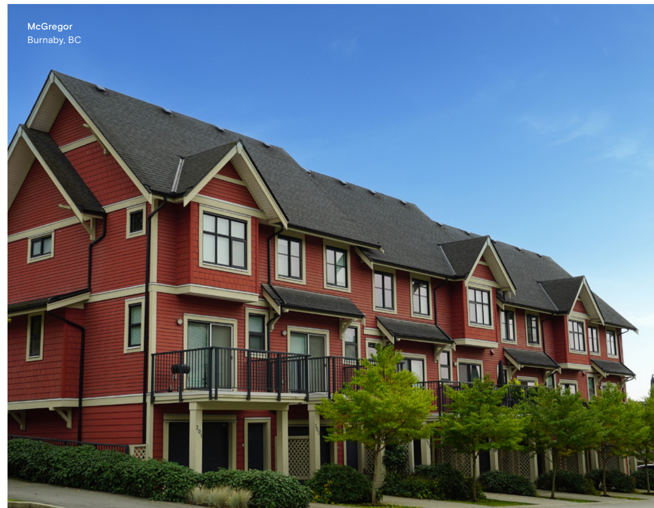
McGregor Burnaby, BC