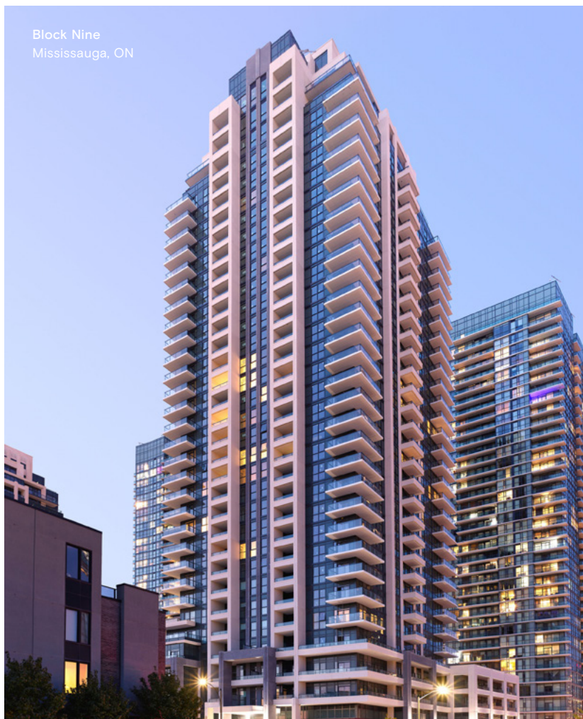
Block Nine Mississauga, ON

All of Amacon's developments are integral to our highly regarded reputation for providing exceptional long-term value. We enhance every project with our award-winning company's dedication to service and customer care. Comprehensive third-party coverage backs all new Amacon homes.