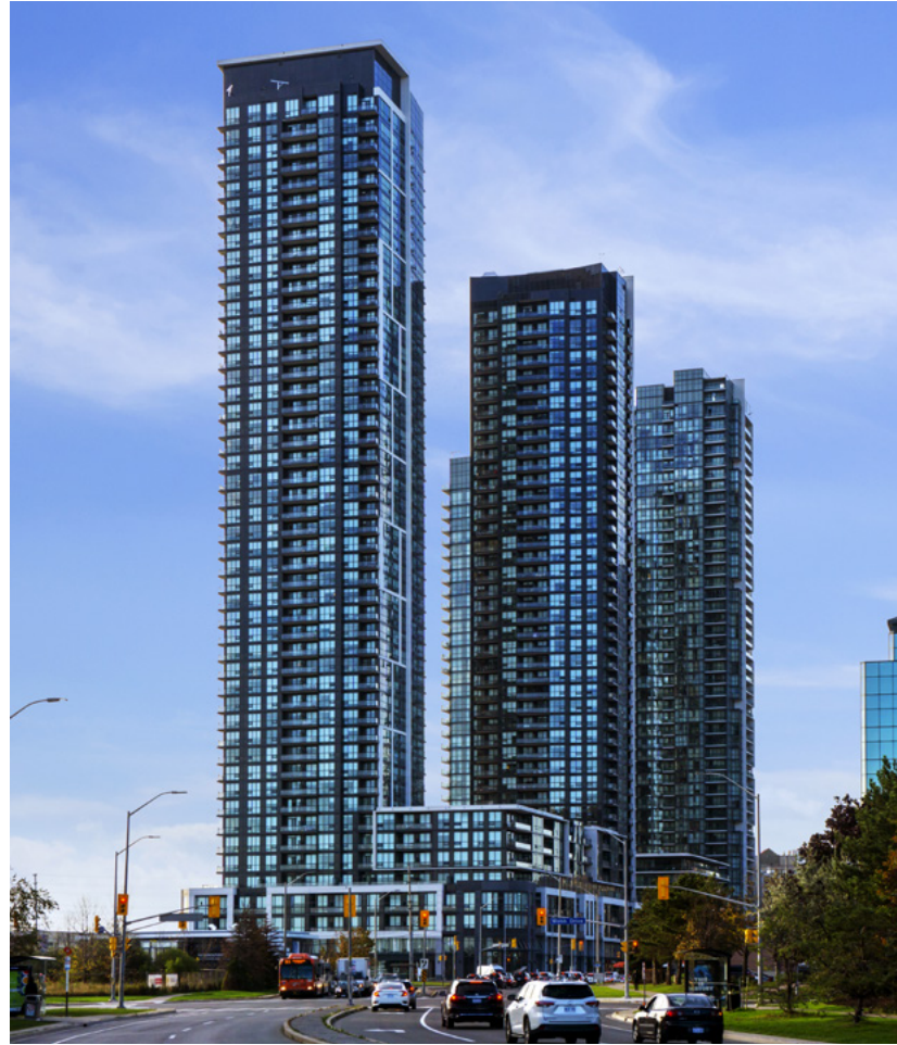
PSV and PSV2